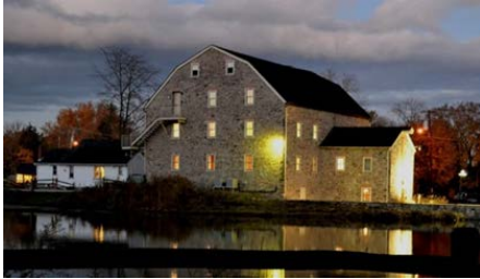
Hunterdon Art Museum