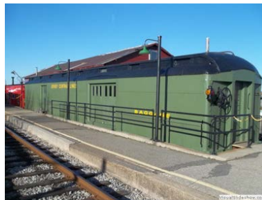
Black River and Western Railroad