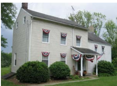
Solitude Heritage Museum – Joseph Turner House