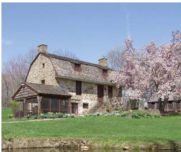
Readington Township Museums