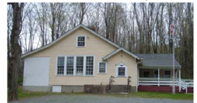
Tewksbury Township Historical Society