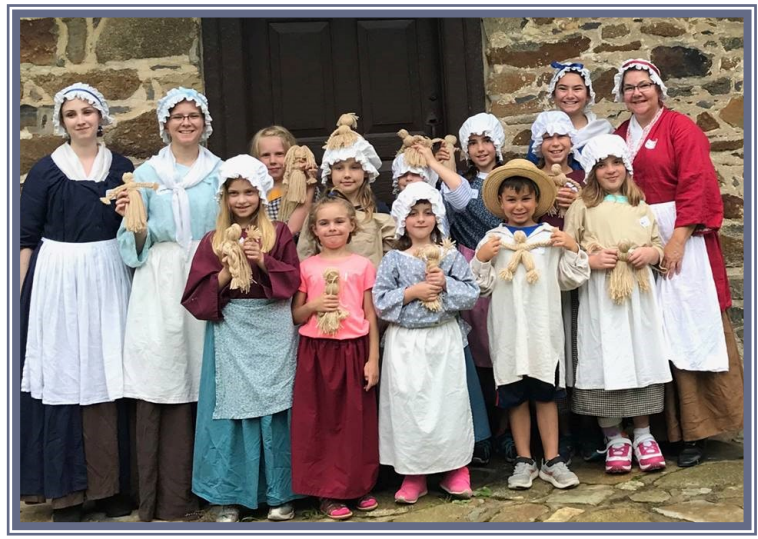
CHILDREN WITH THEIR HANDMADE YARN DOLLS.

The Readington Museums is pleased to announce the return of Monday Mornings at the Museum , a hands-on summer program for kids ages 5-12. The sessions will be held on four consecutive Mondays – July 1, 8, 15, and 22 from 10:00 AM to 12:00 PM at the Bouman-Stickney Farmstead. At each session, the children will have a short history lesson followed by a hands on project, with a new theme offered each Monday. Programs include candle making, tin punch designs, butter making, 18th - century games, and learning an English country dance.