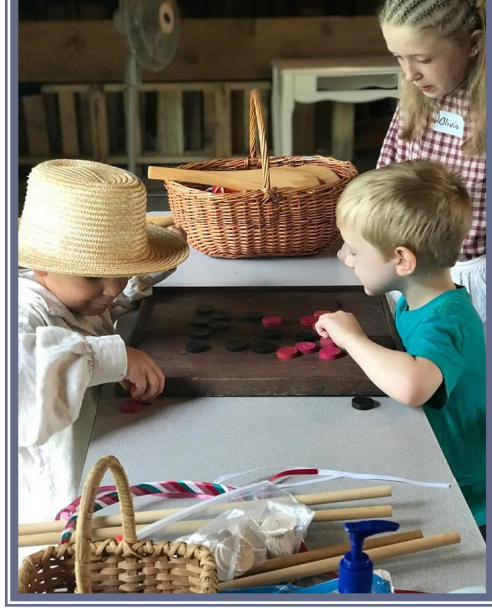
PLAYING COLONIAL GAMES